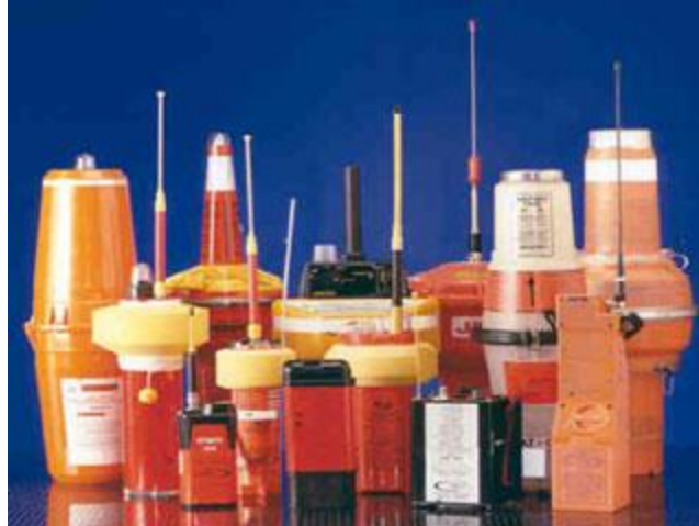
Figure 2 Emergency Beacon Transmitters