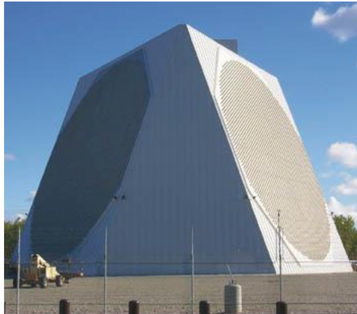
Figure 1. Pave Paws Radar

A Pave Paws radar installation is shown in Figure 1.