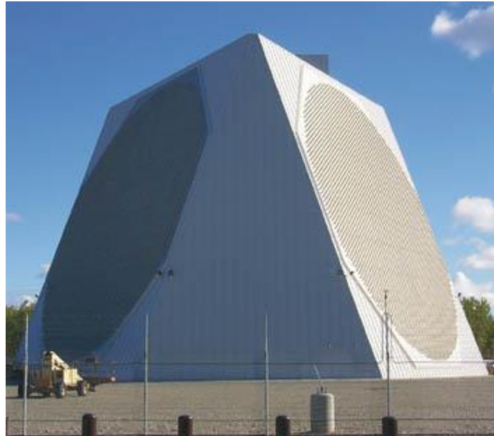
Figure 1. Pave Paws Radar

A Pave Paws radar installation is shown in Figure 1.