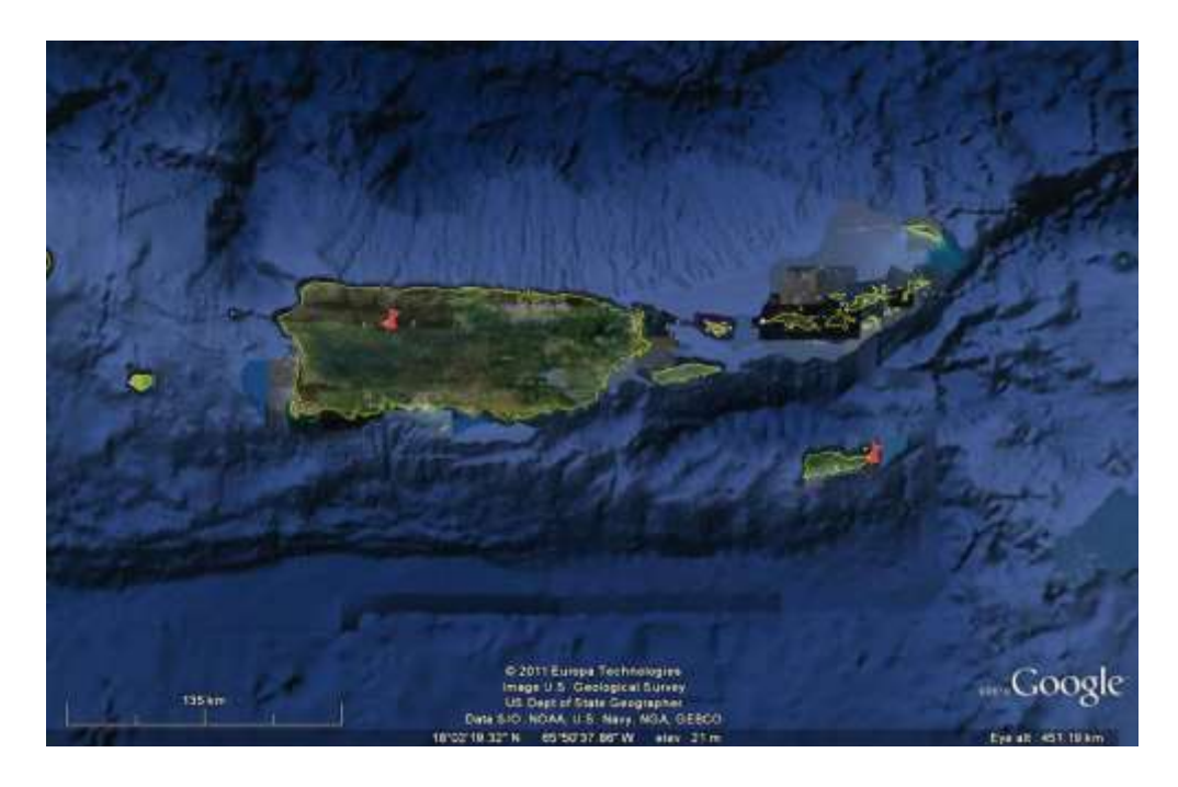
Figure 2. Radio Astronomy Sites in Arecibo, Puerto Rico, and St. Croix, Virgin Islands