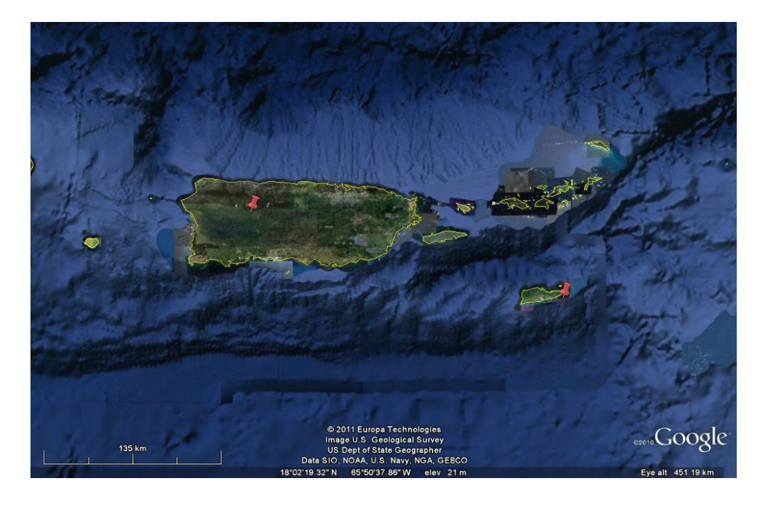
Figure 2. Radio Astronomy Sites in Arecibo, Puerto Rico, and St. Croix, Virgin Islands