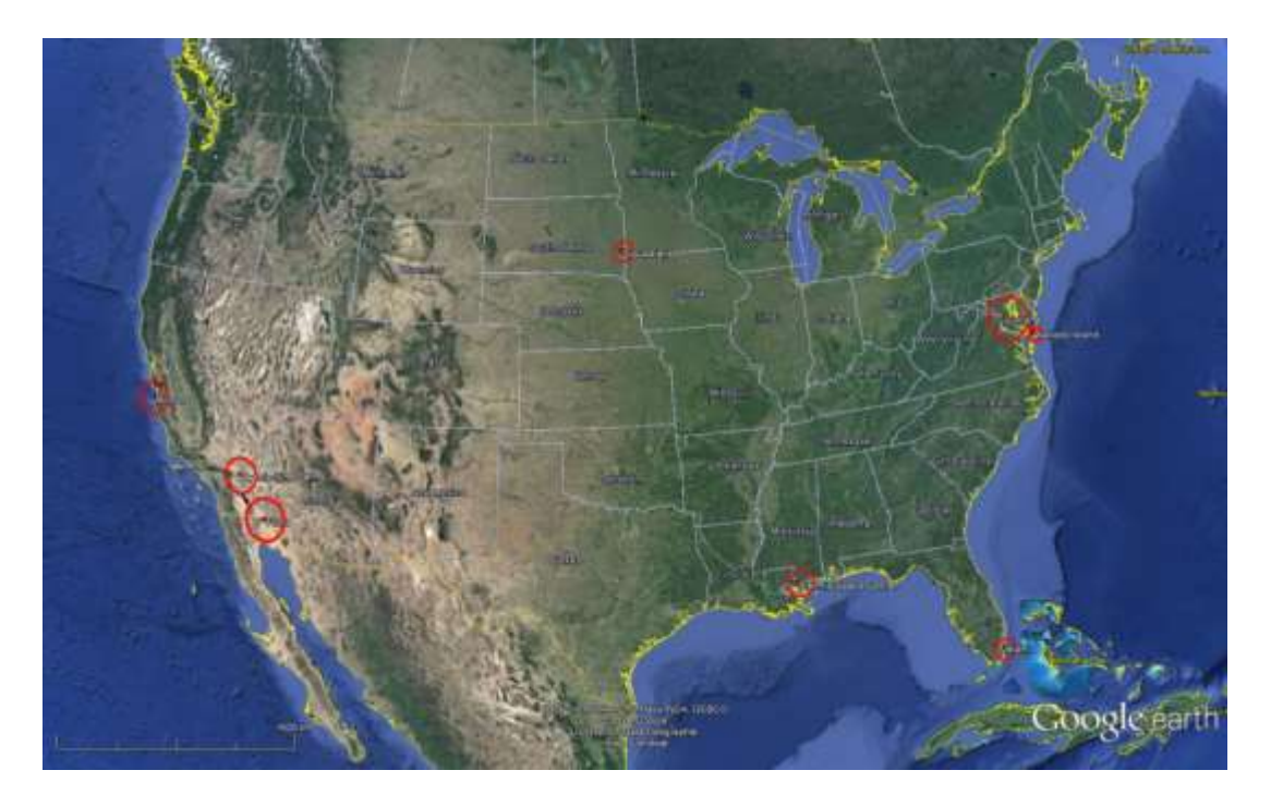
Figure 1. Federal Meteorological-Satellite Receiving Earth Stations, With Protection Zones in the Continental United States

acquires HRPT data from the earth stations at five protected sites in Wallops Island, Virginia; Fairbanks, Alaska; Suitland, Maryland; Miami, Florida and Kaena Point, Hawaii. Figures 1-4 depict locations for Federal agencies meteorological earth station operations in the 1695-1710 MHz band<sup>2</sup>.