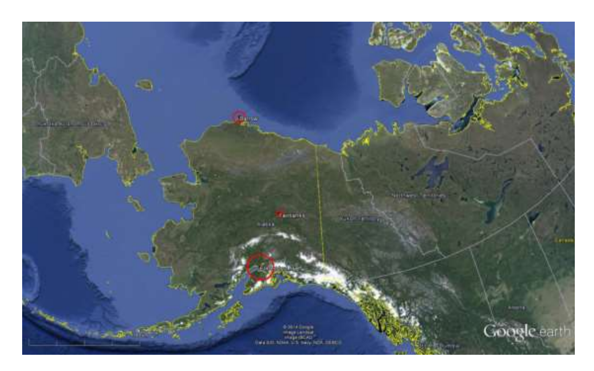
Figure 2. Federal Meteorological-Satellite Receiving Earth Stations, With Protection Zones in the State of Alaska