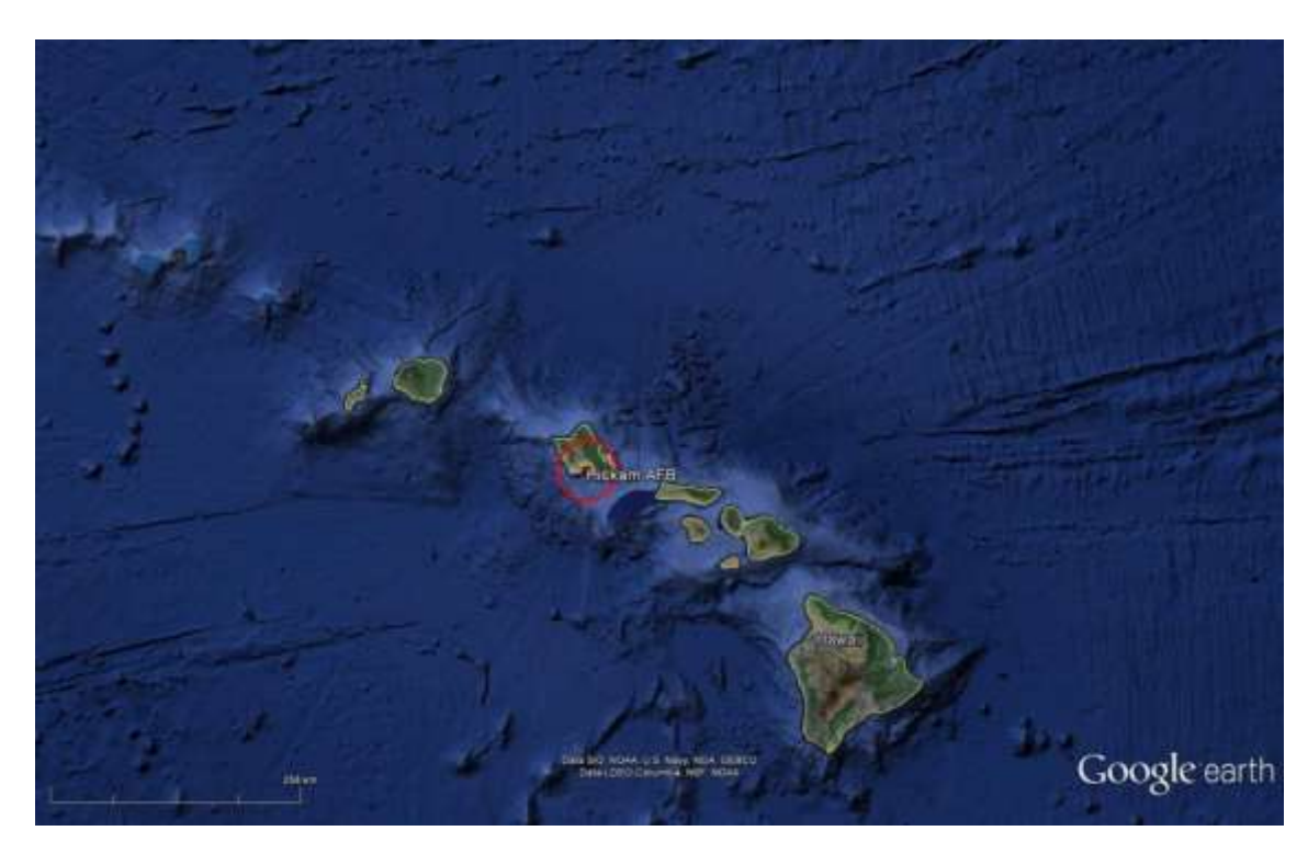
Figure 3. Federal Meteorological-Satellite Receiving Earth Station, With Protection Zone in the State of Hawaii