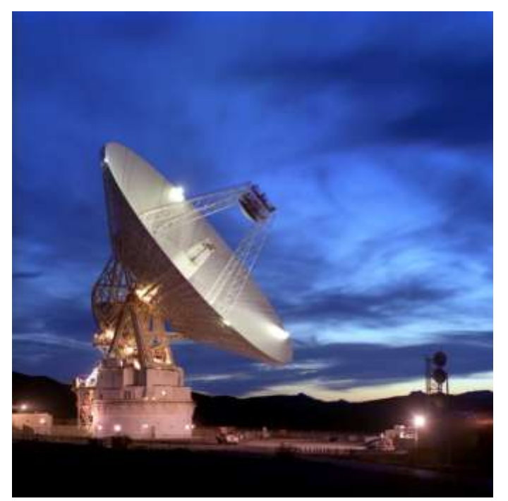
Figure 2. 230-Foot Diameter Antenna at Goldstone, CA<sup>4</sup>