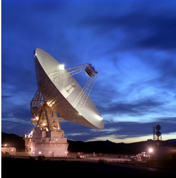
Figure 2. 230-Foot Diameter Antenna at Goldstone, CA 4