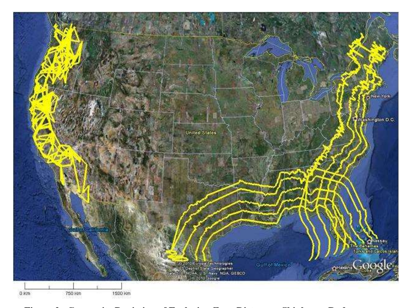
Figure 2. Composite Depiction of Exclusion Zone Distances, Shipborne Radar Systems