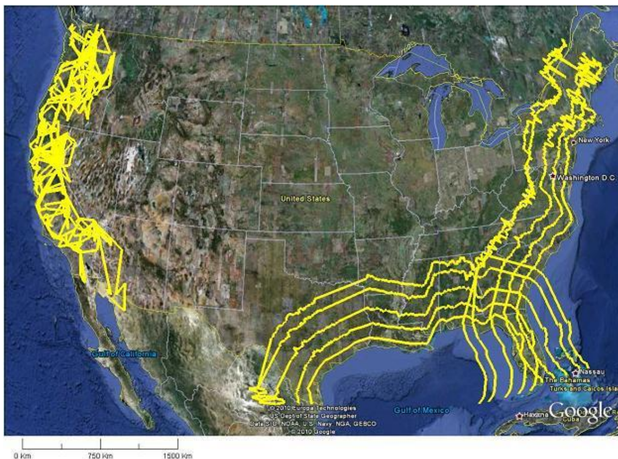
Figure 2. Composite Depiction of Exclusion Zone Distances, Shipborne Radar Systems