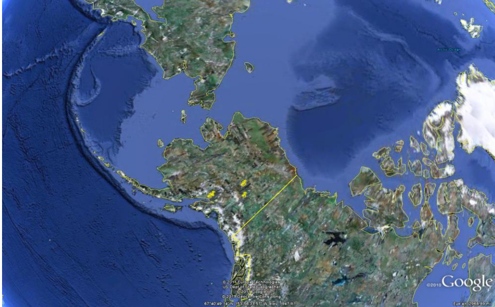
Figure 2: 4500-4800 MHz Federal Government Stations - Alaska