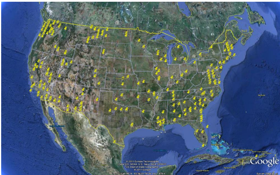
Figure 1: 4500-4800 MHz Federal Government Stations – Continental United States

In addition, the Federal Government operates a number of experimental radio communications in the band for basic research or for the evaluation or testing of electronic equipment or systems that have been developed for operational use. The relative locations of the federal communications systems operating in the 4500-4800 MHz band are shown in Figures 1 to 3.