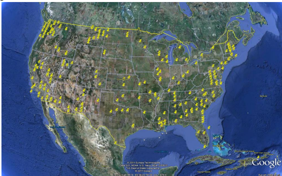
Figure 1: 4500-4800 MHz Federal Government Stations – Continental United States

In addition, the Federal Government operates a number of experimental radio communications in the band for basic research or for the evaluation or testing of electronic equipment or systems that have been developed for operational use. The relative locations of the federal communications systems operating in the 4500-4800 MHz band are shown in Figures 1 to 3.