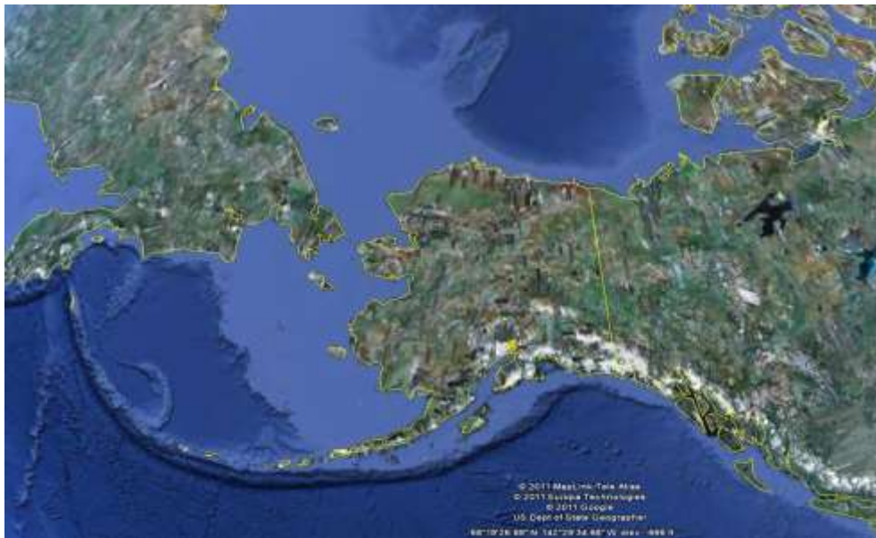
Figure 2: 4800-4940 MHz Federal Government Stations – Alaska