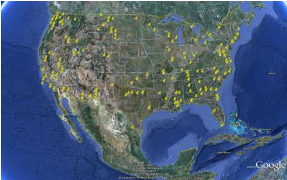
Figure 1: 4800-4940 MHz Federal Government Stations – Continental United States

The geographical locations of Federal stations of the 4800-4940 MHz band are shown in Figure 1 and Figure 2.