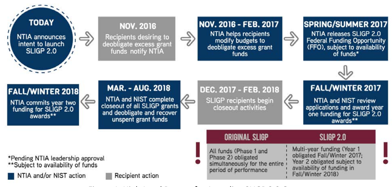
Figure 1: High-Level Process for Awarding SLIGP 2.0 Grants

The graphic below (Figure 1) depicts the high-level process the SLIGP Program Office envisions for awarding SLIGP 2.0 grants, subject to the availability of funding. The Program Office will seek NTIA leadership approval in the first half of 2017, under the new administration, to release an FFO and commit year one funding if the minimum threshold of $25M is met.