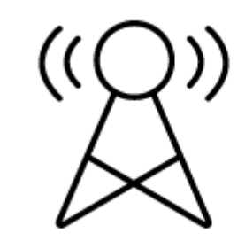
Basic Network Services (5-13)