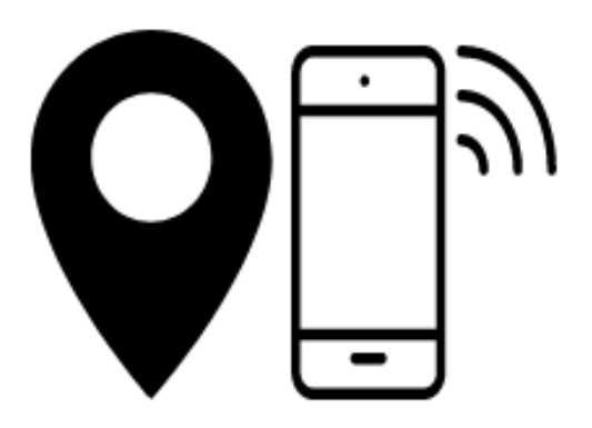
FOC Coverage Map (5-12)