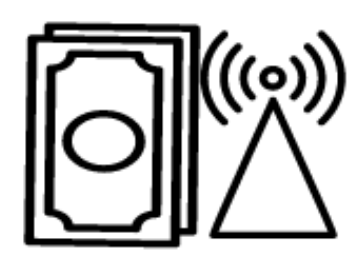
Spectrum Monetization Assumptions