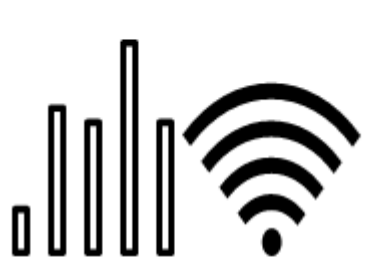
Network Performance Metrics