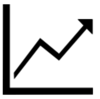
Budget Detail Spreadsheet